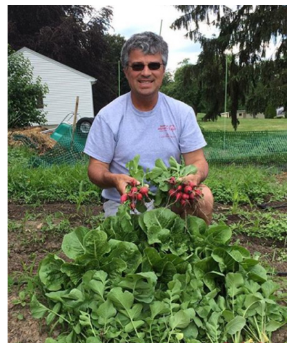
First fruits from the St. Jeanne Jugan Parish garden established on our property.