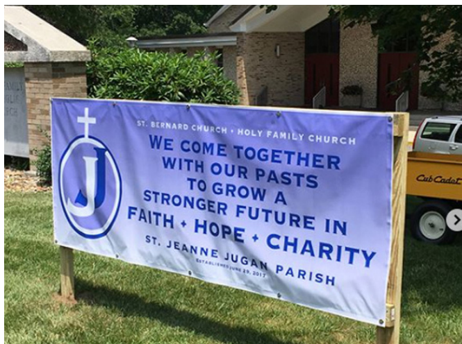
Banners announcing new St Jeanne Jugan Parish have been placed in front of St Bernard and Holy Family churches here in Enfield.

Serving the elderly poor in Enfield, Connecticut since 1972.